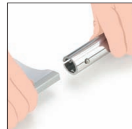
Instant graphic change facility.