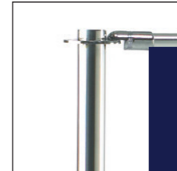
Tamper proof bar-to-post fixing mechanism.