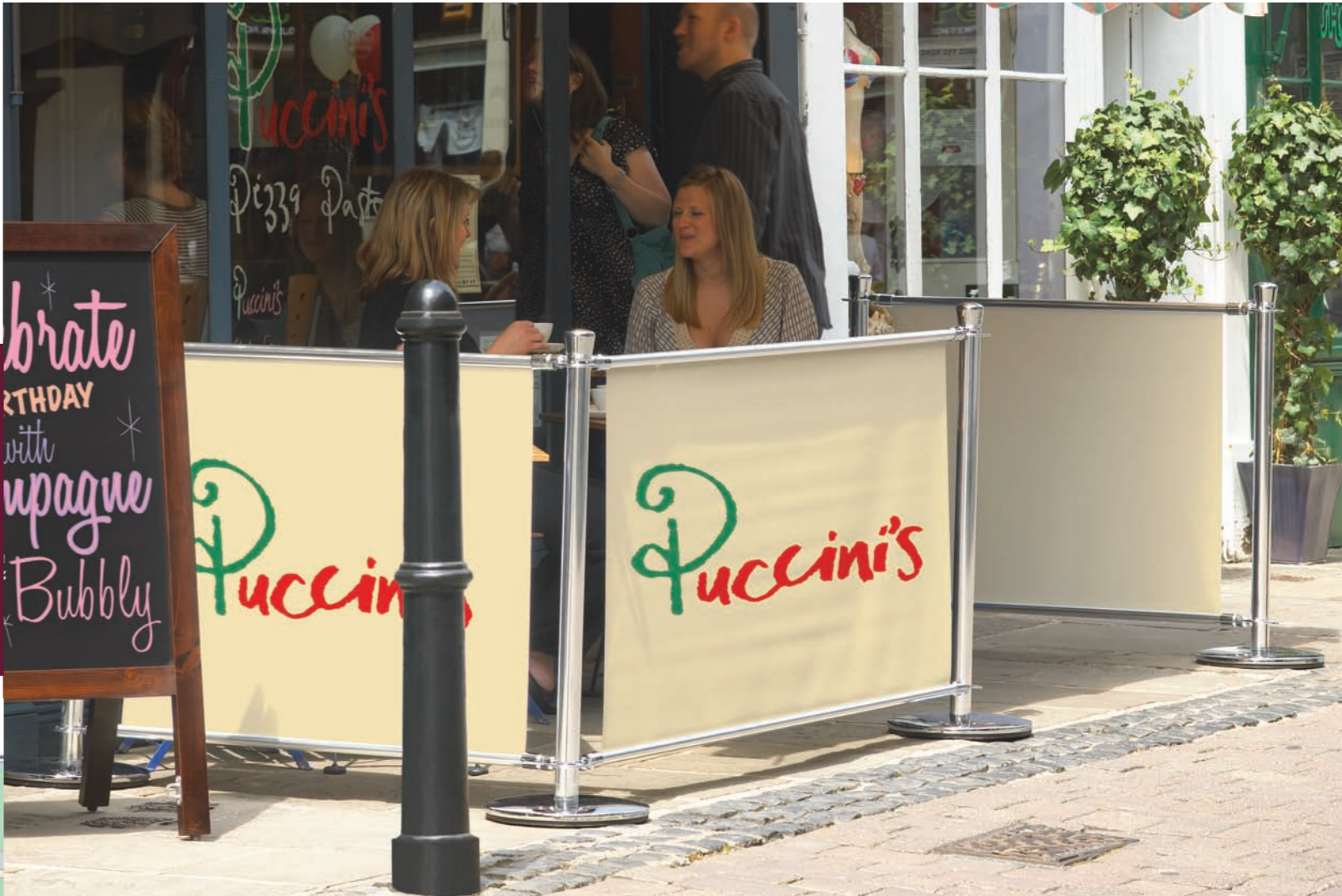
primo café banner

Our café banners are an excellent way to create alfresco eating, drinking or smoking areas. Café barriers provide opportunities to improve street level visibility of your brands and promotions with style, at an affordable price.