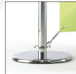
Chrome base and post with spring clip graphic attachment.