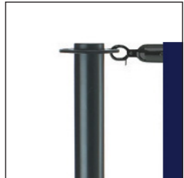
Easy clip bar-to-post fixing.