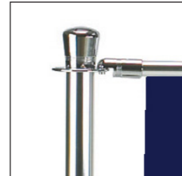
Tamper proof bar-to-post fixing mechanism.