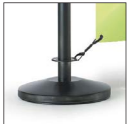
Black powder coated domed weighted base and post with spring clip graphic attachment.